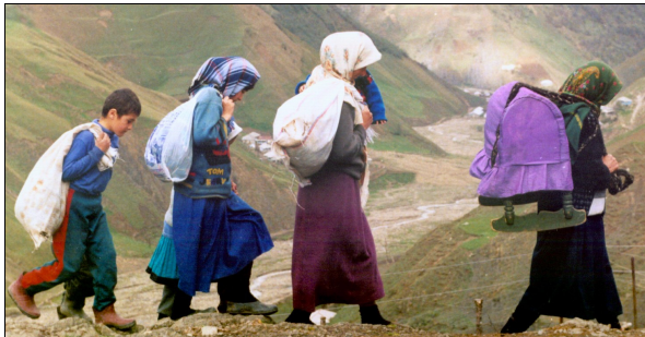
Refugee family fleeing conflict in Chechnya

Refugees are people who have fled their native countries and cannot return due to a legitimate fear of persecution, based on their race, religion, nationality, membership in a particular social group or political opinions. They are driven from their homes by violence and may spend years in exile in refugee camps. There are currently an estimated 14 million refugees worldwide. Some may eventually be accepted for permanent resettlement by other countries (fewer than 1/2 of 1% of all refugees are accepted by the US).